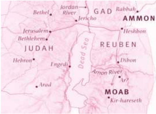
Map of the Journey of Elimelech

Aim: To understand that 'salvation is for everyone'.