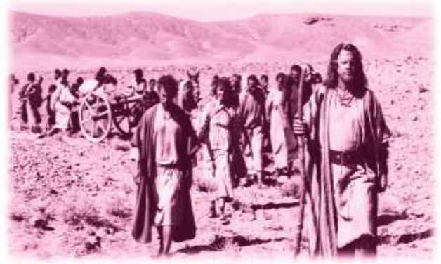
Exodus of Israelites

What are these pictures speaking to us? (Discussion)