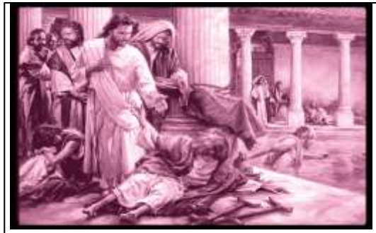
Crippled for 38 years, a man was laid there in agony abandoned by his friends and relatives. Jesus came and healed him; and sooner he took his bed and went back home. Glory be to the Lord who had compassion on him seeing his misery.

Sthambithan aai muppathettand oru kattinmel Bheekara vedhana poondum kidannarum nokkathu Vezhchakkar koottalikalum vittu odi poi Karthavavane sandharshippan aai ezhunnelli Sheekram enetta kkattilum enthi Santhoshathaal geham chernnaan Dhainyatha kandu sukham nalkiya naadhan samsthuthyan.